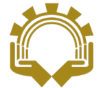
اتحاد الصناعات المصرية FEDERATION OF EGYPTIAN INDUSTRIES