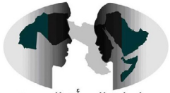
رابطة المرأة العربية Alliance For Arab Women